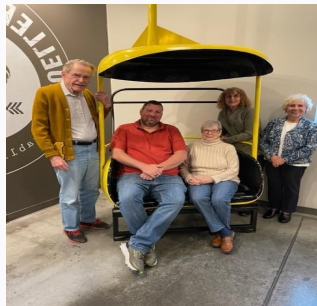
Fundraising Event at Moeller Brew Barn

What an incredible, wonderful and amazing year 2023 was. So lets take a walk down memory lane.