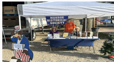
Garver Family Farm Fall Event