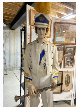
Mannequins and Uniforms