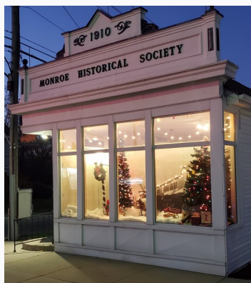
The museum dressed for the holidays