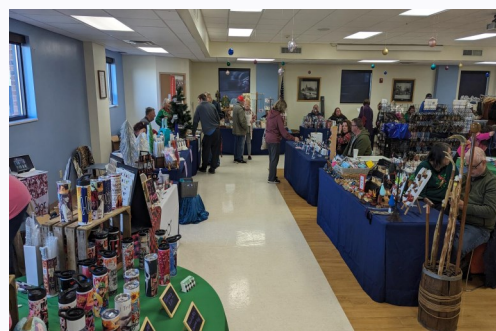
Small Business Saturday Market Event put on by the City of Monroe