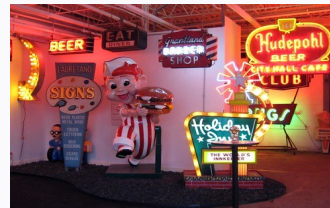
Cincinnati Sign Museum

Thank you to our 2024 partners and business members :