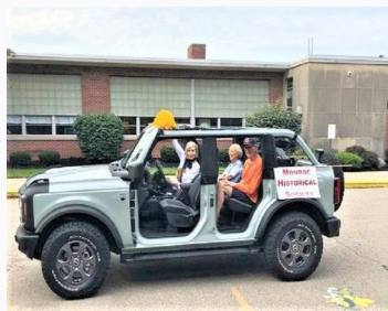
4th of July Parade