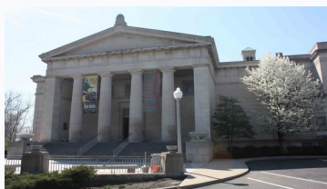
Cincinnati Art Museum